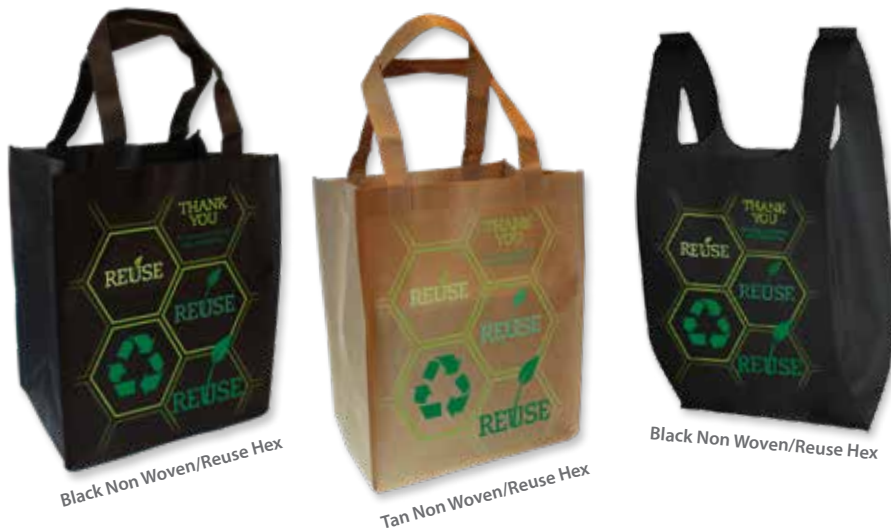
Black Non Woven/Reuse Hex